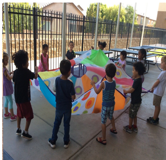
Our Pre-K children having fun and learning to take turns.

It's been a great summer, we have learned about safety, gone exploring, became pirates and princesses, learned how to build all kinds of things, and discovered our inner super hero. And that was just in June. We are looking forward to lots of new discoveries in July, making new friends, and getting ready for the new school year, some of our children will be moving on to kindergarten while our preschoolers will be moving up to the pre-k class. We only have a few weeks of summer left so we will enjoy them and look forward to an exciting school year in August.